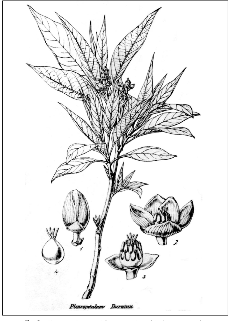
Fig. 2. Pleuropetalum darwinii type specimen (Hooker 1846, t. 2)

Hooker, J.D. 1846: Description of Pleuropetalum , a new genus of Portulacaceae, from the Galapago Islands. London Journal of Botany 5: 108–9, t.2.