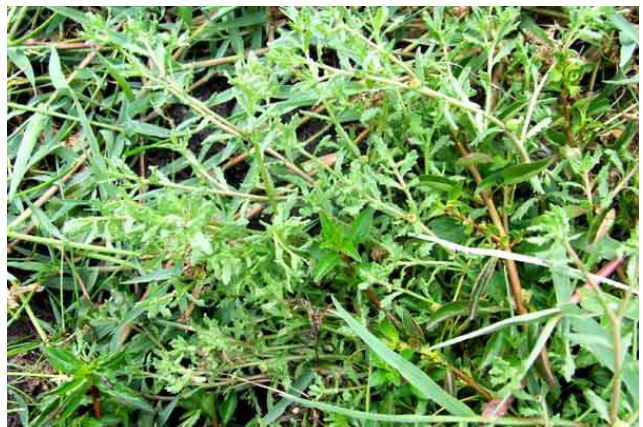
Fig. 12. Centipeda aotearoana , dry lakelet, Lake Tāngonge, 27 March 2014.