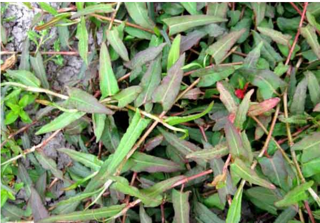
Fig. 7. Persicaria strigosa , Lake Tāngonge. Photo: Mike Wilcox, 27 March 2014.