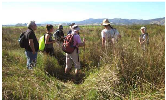
Fig. 4. Our group, Lake Tāngonge, Kaitiaki. Photo: Mike Wilcox, 27 March 2014.