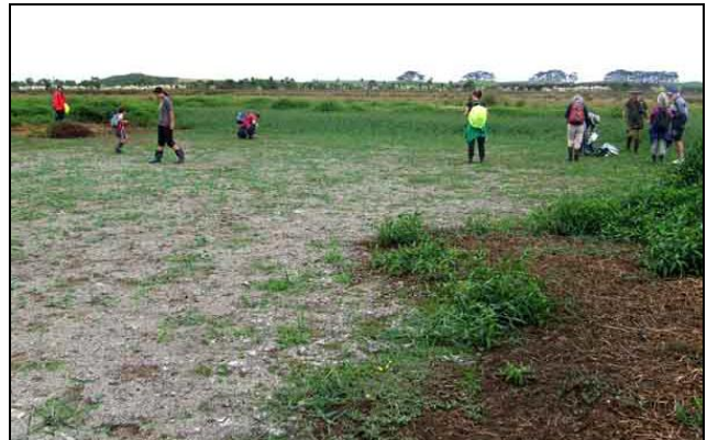
Fig. 11. Dry lakelet, Lake Tāngonge. 27 Mar 2014.