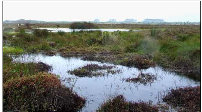
Fig. 10. Ephemeral winter lakelets, Lake Tāngonge. Photo: Lisa Forester, 4 Sep 2013.

Kanuka/kahikatea: At the northern end of Lake Tāngonge we entered an area of former Department of Conservation land where kanuka ( Kunzea ericoides ) had developed into tall, open stands in which Coprosma parviflora was a very prominent shrub. Several groups of pole kahikatea ( Dacrycarpus dacrydioides ) survive precariously, and some trees