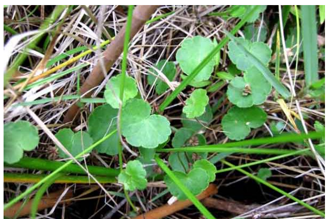
Fig. 13. Hydrocotyle pterocarpa , in marginal shrubland, Lake Tāngonge. Photo: Mike Wilcox, 27 March 2014.