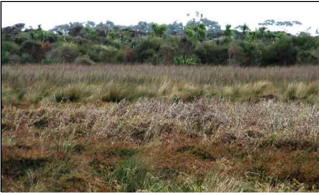
Fig. 5. Tall sedgeland with marginal scrub at back, Lake Tāngonge.. Photo: Lisa Forester, 4 Sep 2013.