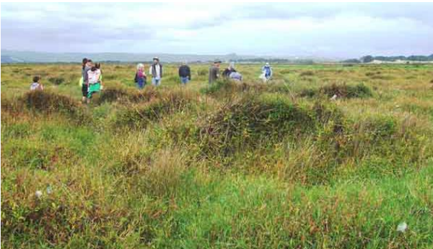
Fig. 6. Rushland and willow-herb vegetation, Lake Tāngonge. Photo: Lisa Forester, 27 Mar 2014.