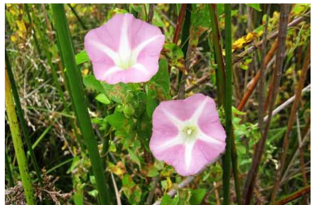
Fig. 9. Calystegia sepium subsp. roseata , Lake Tāngonge. Photo: Mike Wilcox, 27 March 2014.

Rushland and willow-weed beds: This is the dominant vegetation of much of the area (Fig. 6). Tall rushes present were Juncus edgariae , J. effusus , and J. sarophorus . Abundant sedges were Eleocharis acuta , Isolepis prolifera , and Carex longii . Species of Persicaria formed a dense cover over large areas, and are also part of the plant assemblage in the tall sedgeland. The indigenous Persicaria decipiens was the most abundant species, and the other ones, also common, were P. hydropiper , P. maculosa and P. strigosa (Fig. 7). Alligator weed ( Alternanthera philoxeroides ) and primrose willow ( Ludwigia peploides subsp. montevidensis ) (Fig. 8) were prominent, while beggar's ticks ( Bidens frondosa ) and annual saltmarsh aster ( Symphotrichum subulatum ) had a scattered presence. Two grasses, creeping bent ( Agrostis stolonifera ) and freshwater paspalum ( Paspalum distichum ), were very common throughout this vegetation type, with Yorkshire fog ( Holcus lanatus ) also present. Pink bindweed ( Calystegia sepium subsp. roseata ) scrambled and