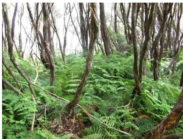
Fig. 14. Hypolepis distans under manuka, western margin, Lake Tāngonge.