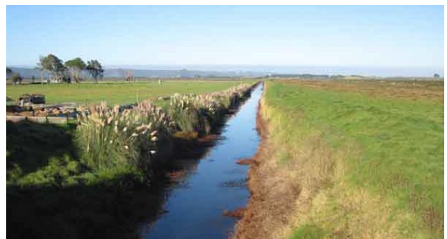
Fig. 3. Waihoe Channel, Lake Tāngonge, Kaitiaki. Photo: Mike Wilcox , 28 March 2014..