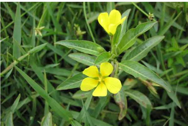
Fig. 8. Ludwigia peploides subsp. montevidensis , Lake Tāngonge. 27 March 2014.

Weedy fringes: Kikuyu grass ( Cenchrus clandestinus ) formed a thick cover along the bund (derived from spoil) of the drain and on the fringe of the wetlands. Cocksfoot ( Dactylis glomerata ) was also present. Damp areas had patches of penny royal ( Mentha pulegium ), Anthemis cotula , Cyperus eragrostis , Lythrum junceum and Lotus pedunculatus , Polygonum arenastrum , Oenanthe pimpinelloides , Sonchus asper , Leontodon saxatilis (syn. L. taraxacoides ) and Rumex conglomeratus . A single clump of white rain lily ( Zephyranthes candida ) was recorded.