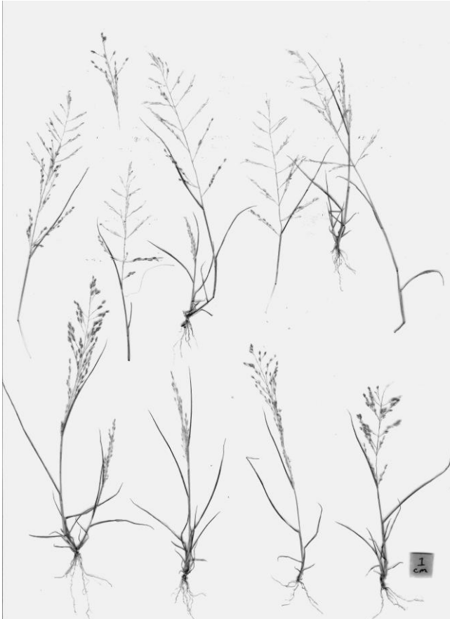
Fig. 1. ROG 11140 & P. J. de Lange (AK 325970) [greyscale scan]. Scale 1 cm.

plants. The little purplish-crimson spikelets had mostly eroded away, but some held abundant seed, and once this plant gets east across the bridge into the Kakamatua Inlet car-park it will likely soon begin to appear elsewhere in the Waitakeres.