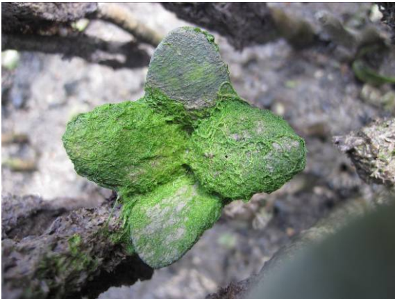
Growing on the leaves of a mangrove seedling, Favona, Manukau Harbour, 6 Oct 2010.