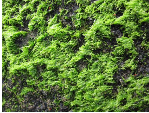
On hard volcanic tuff, North Head, Waitemata Harbour, 31 Aug 2010.