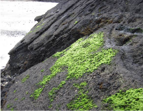
On hard volcanic tuff, North Head, Waitemata Harbour, 31 Aug 2010.