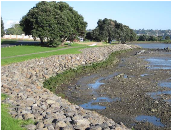
Forming a high-tide green band on a newly-built sea wall, Kiwi Esplanade, Mangere Bridge, Manukau Harbour, 12 Oct 2010.