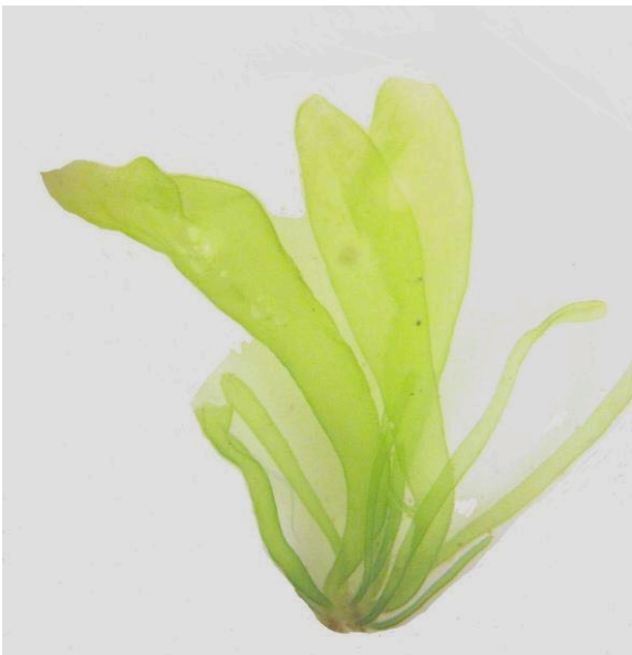
Blidingia minima , Maraetai, 10 Oct 2010. Whole plant 6mm tall.