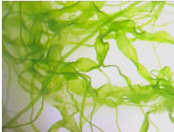
Mangere Bridge, Manukau Harbour, 29 Sep 2010. Thalli 70-250 \mu\text{m} wide.