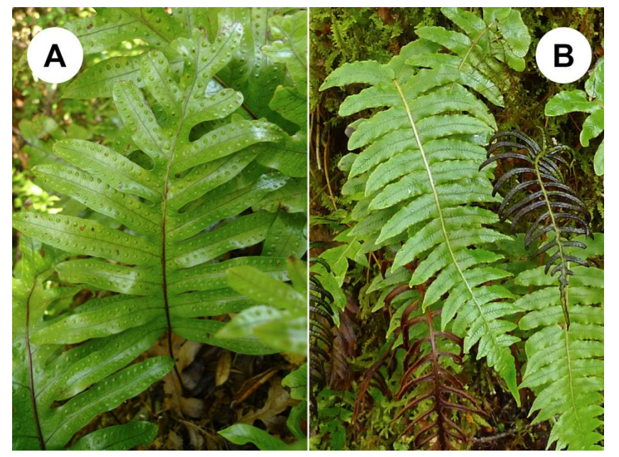
Figure 2. Native New Zealand ferns superficially similar to Polypodium vulgare . A: In Microsorum pustulatum the lamina is not dissected right to the rachis, and the margins are entire. B: Blechnum deltoides (previously known as B. vulcanicum ) has distinctive fertile fronds with narrow pinnae (at middleright and bottom-centre in this image).

Figure 1. Polypodium vulgare. A: Frond, with the lamina dissected to the rachis. B: Crested forms occur rarely in the wild; this is from a northern Canterbury population. C: Underside of fertile frond, showing the unprotected orange sori (clusters of spore-producing sporangia), the lamina dissected to the rachis, and the serrate lamina margins. D: Creeping rhizome.