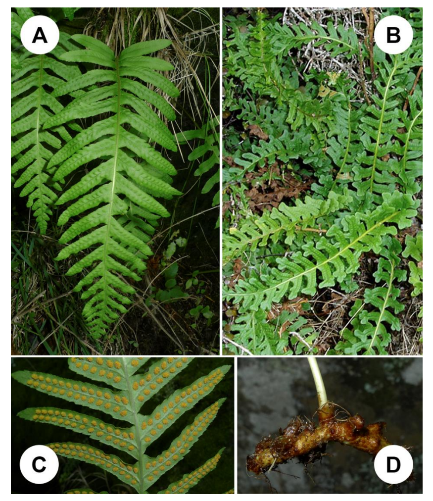
Figure 1. Polypodium vulgare. A: Frond, with the lamina dissected to the rachis. B: Crested forms occur rarely in the wild; this is from a northern Canterbury population. C: Underside of fertile frond, showing the unprotected orange sori (clusters of spore-producing sporangia), the lamina dissected to the rachis, and the serrate lamina margins. D: Creeping rhizome.

is also superficially similar to P. vulgare , but easily distinguished by reproductive features; the sori of B. deltoides are linear on dimorphic and much-narrowed fertile fronds, while they are circular in P. vulgare (Figs. 1 and 2).