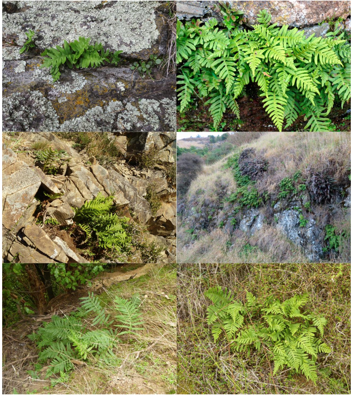
Figure 5. Some of the habitat diversity of Polypodium vulgare .

even in damp seepages, albeit rarely (Fig. 5). It ranges from full-light, open sites to heavy shade, and has been recorded in both very hot sites and very cold sites. Its ability to drop its fronds and survive as just a rhizome means it is probably most reliably located in spring when it is producing new fronds.