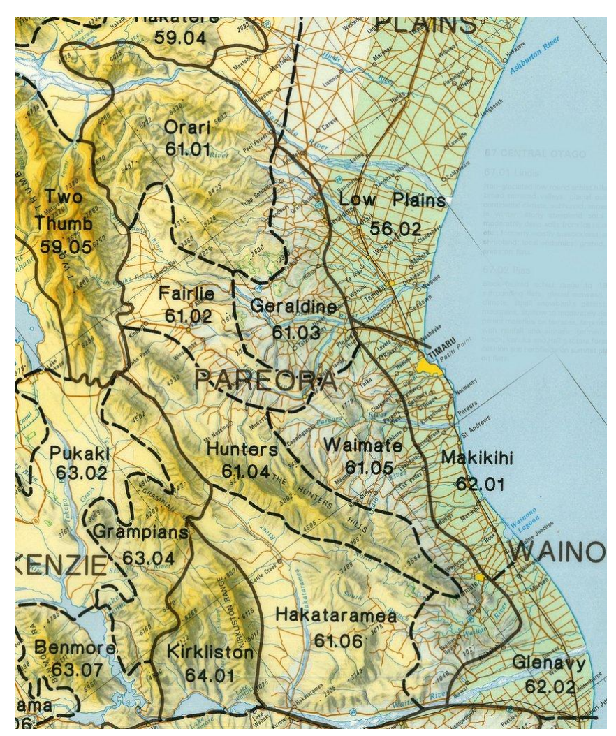
Figure 1 Map of South Canterbury showing Pareora Ecological Region and its six ecological districts.

This is the second list of liverworts and hornworts for an ecological region on the drier eastern side of New Zealand. The first was the list of liverworts and