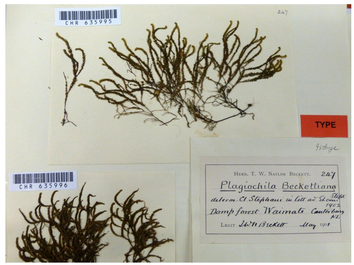
Figure 5 The isotype of Plagiochila beckettiana at CHR showing the beautiful arrangement Beckett made that shows the branching arrangement of the plant.

Hatcher; and Plagiochila beckettiana, a synonym of Plagiochila fuscella (Hook.f. & Taylor) Gottsche, Lindenb. & Nees, also collected at Waimate Bush. The holotypes of these species are in Geneva Herbarium but Beckett retained part of each specimen, which now are isotypes at CHR. Beckett's bryophyte collections are very well curated in that Beckett laid plants out on the mounting sheet so their form can easily be seen, and put additional material into a folded paper packet next to the mounted specimen (Fig. 5).