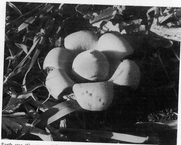
Earth star ( Geastrum triplex )

"Don't never forget": Seek and ye shall not find.