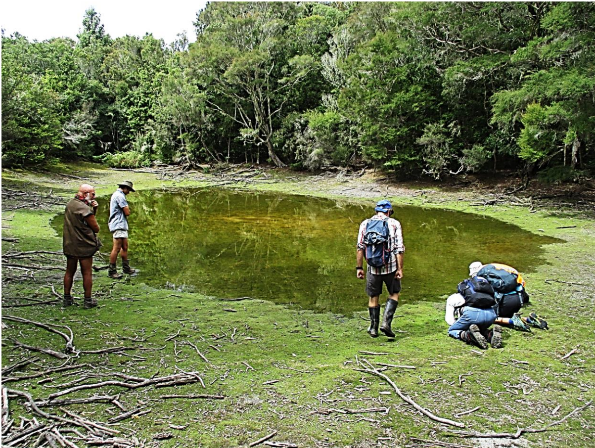
Figure 3. Botanists hard at work in the turfs around the 'pond'.

We eventually reached the 'pond' which had a moderate amount of water in it, given recent rain. Steve noted it was normally dry in February and full in winter as it has no natural outflow. While the majority of the party rested and chatted the hard-core botanists excitedly set to work combing through the turfs for any species of interest, as this was the first time that most of us had visited this ephemeral wetland. Species noted in turfs included Myriophyllum pedunculatum which was mostly in the water; Glossostigma elatinoides and Limosella lineata were both common, with occasional Lobelia angulata . Gonocarpus micranthus was also present further out of water on drier margins. Also noted was Galium propinquum , Hypericum pusillum , and Euchiton delicatus . A small patch of Schoenus maschalinus was also found. The wetland was surrounded by forest with some old kanuka ( Kunzea robusta ), Hall's totara, rewarewa, kamahi and a toatoa ( Phyllocladus toatoa ) tree noted.