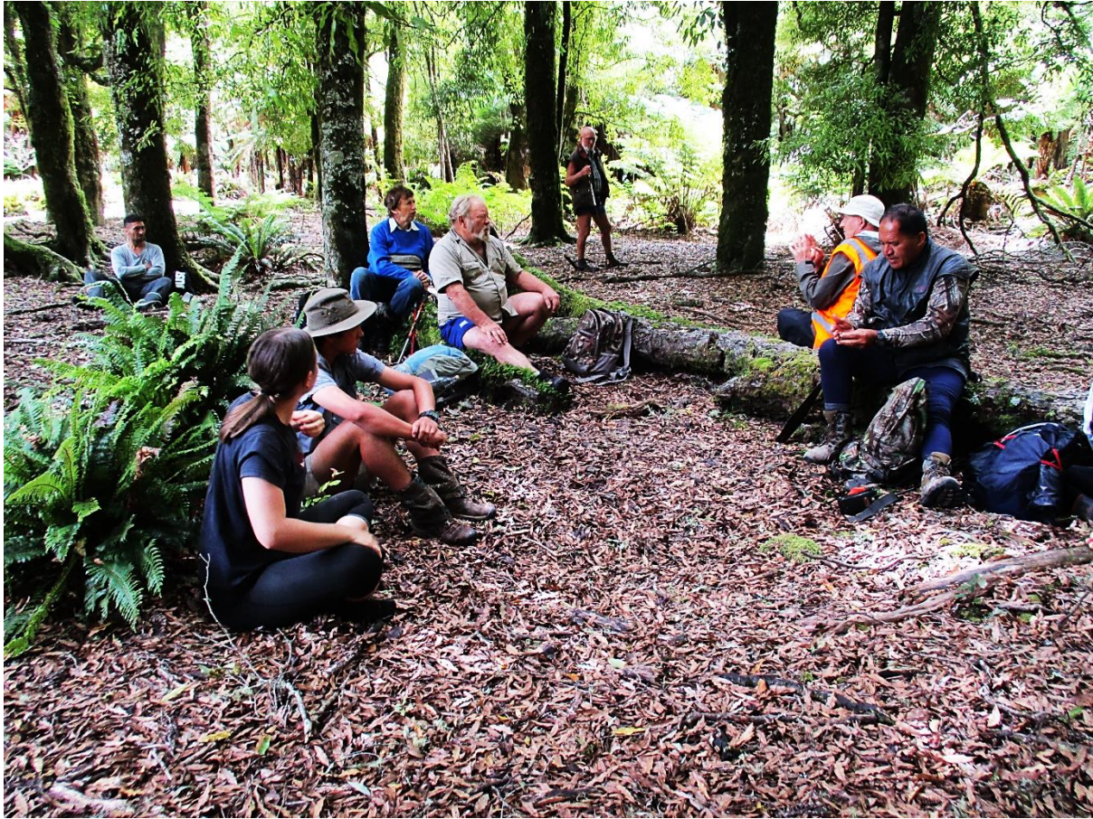
Figure 2: Lunch under the open tawa forest on the edge of the clearing.

We headed back out to the access track and debated if there was time to head south to the large clearings near the hut. While some were keen most thought that it would take too long and not leave enough time for botanical exploration, so that was left for another day. We headed briefly back north along the access track before heading west off-track following GPS with the aim of locating a small unnamed depression or 'pond' as it is known, shown on the topographical map at NZTM 1902677 5771595, that Steve had visited many times.