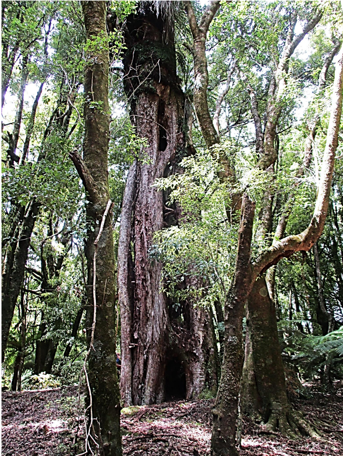
Figure 4: Large emergent live northern rata seen near lunch clearing.

share knowledge and ideas, which has been invaluable for all present. Some stories about the past history of the block were also shared, which enriched the learnings for the day.