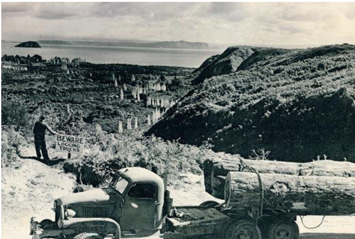
Photo: A truckload of podocarp logs from Opawa Bush en route to Fletcher's mill at Te Rimu on the Tauranga-Taupo River one autumn day in the 1950s.

The rapid growth of towns and cities in the post-war boom saw a huge demand for timber of all kinds. Sawmilling companies eager to supply the demand scoured the country for millable native forest in all tenures, and the mature podocarp stands on easy pumice terrain on the central plateau were a prime target. Little wonder then that magnificent Opawa Bush – like so many others – fell victim to the timber-hungry times.