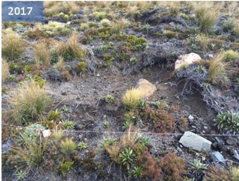
Figure 2: Crater 4 photographed in 2017, illustrating the species composition inside and outside the craters

richness, and an increase in percent cover. This suggests species survived the initial impact of the projectile but experienced subsequent dieback followed by regeneration.