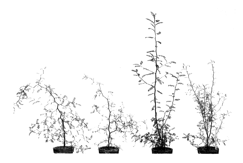
Fig. 2. Comparison of one-year-old Sophora seedlings. Origin of seed (collected in 1985), left to right: Halkett, Canterbury ( S. microphylla ); beach drift, Chatham Island ( S. microphylla ); Waikato Point, Chatham Island ( S. chathamica ); beach drift, Chatham Island (form of S. microphylla or a hybrid). Scale in right-hand pot = 10 cm.